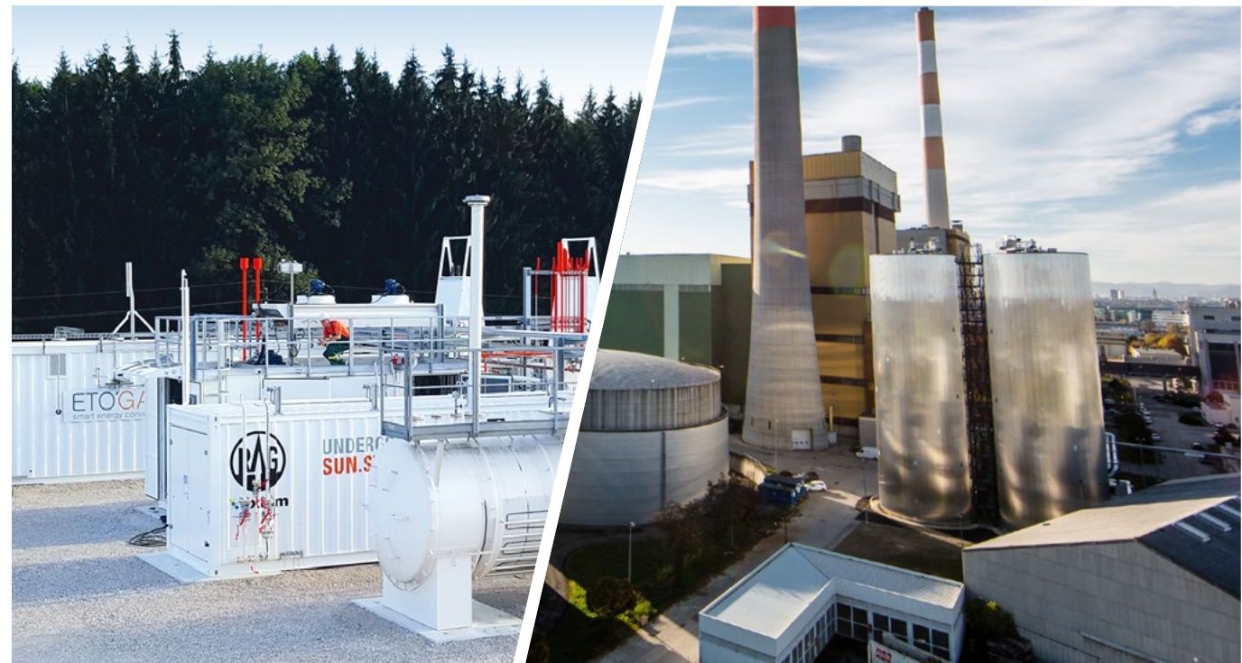
Photo left: Research facility „Underground Sun Storage“; right: High-pressure heat storage facility